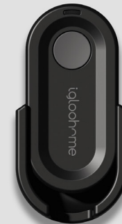
KEY FOB MOUNTING BRACKET